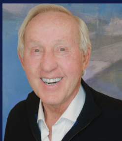
Fran Tarkenton Founder & CEO

Since 2003, I have been partnering with elite financial professionals who care about creating a better retirement for their clients and, in turn, a better life for themselves. At Tarkenton Financial, we believe that the mission of business is to help people. Of all of my businesses throughout my career – this easily provides me with the most passion and satisfaction. It comes from the fulfillment of helping my partners meet their personal goals as they help their clients meet long-term financial goals and improve their retirement strategies.